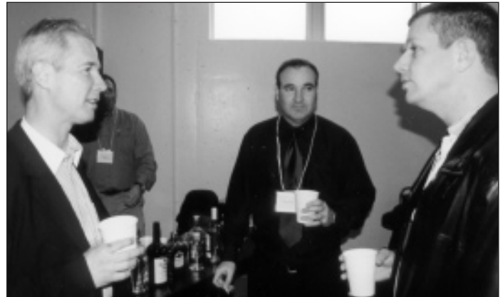
Participants were asked to drink beyond levels of 0.08% BAC in order to measure their ability to function.

"The majority of participants said after a couple of drinks that they were not fit to drive – and yet it took many more drinks before they registered above the 0.05% BAC level," says Nancy