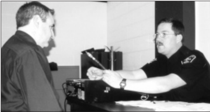
Trained police and breath toxicologists were on hand at the Durham College, Police Training Centre, in Oshawa to record the results.

The participants were required to complete a number of sobriety tests while consuming measurable amounts of alcohol in a given period of time. Qualified police intoxilyzer technicians, using recognized breath equipment, administered standard breath and field tests to the participants to determine their blood alcohol concentration (BAC) levels. The tests were videotaped and the police and local MADD Canada representatives were on hand to make observations and to draw conclusions about what transpired through an afternoon of 'partying'.