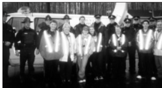
The Halifax Regional Chapter assists police with roadside stops on the May Long Weekend.